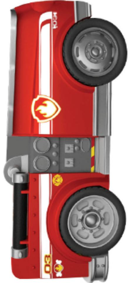
BACK OF CAR