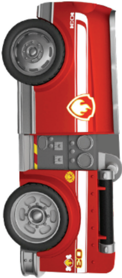
BACK OF CAR